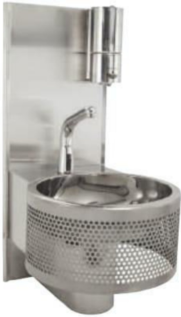
YIBTECH STR DD 40

Paper Towel Dispenser 18/8 304 4/N Satin finish, stainless steel. Paper towel dispenser with waste receptacle. Surface mounted. Lock system. Dim.: 300x170x1000mm