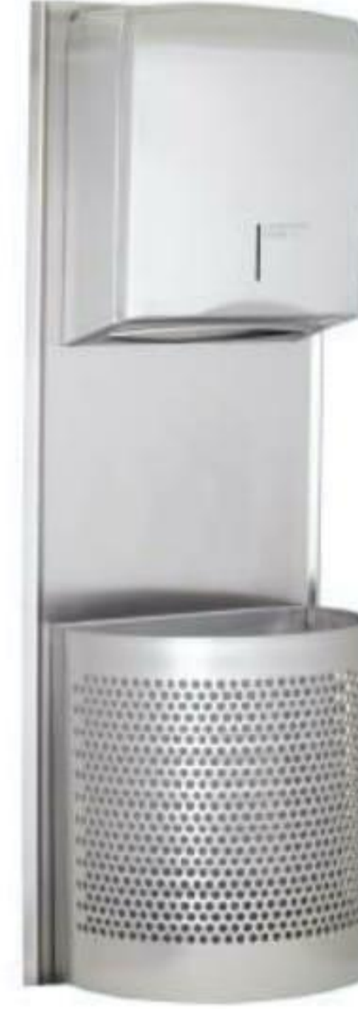
YIBTECH STS 100 D

Paper Towel Dispenser 18/8 304 4/N Satin finish, stainless steel. Paper towel dispenser with waste receptacle. Surface mounted. Lock system. Dim.: 300x120x1000mm