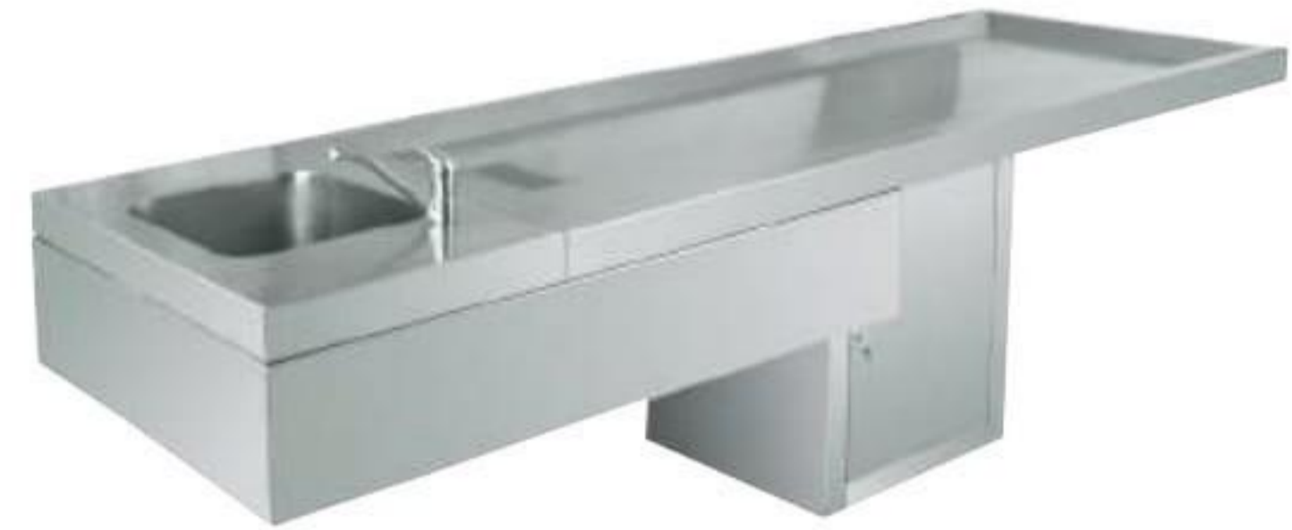
YIBTECH STK OT / 01