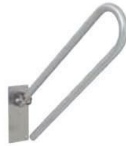
YIBTECH BEH 75

Gab Bar 304/4N Satin finish, stainless steel. Dim.: Ø32x600mm