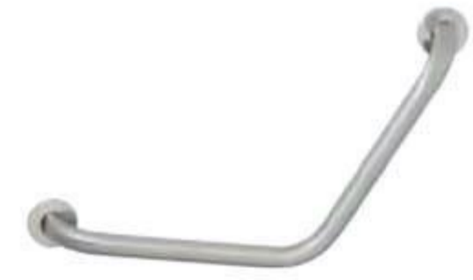
YIBTECH BEV 120

Gab Bar 304/4N Satin finish, stainless steel. Dim.: Ø32x750x750mm