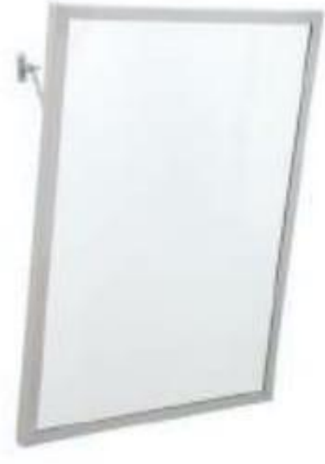
YIBTECH BAY 01

Adjustable Mirror 304/4N Satin finish, stainless steel. Dim.: 500x25x700mm