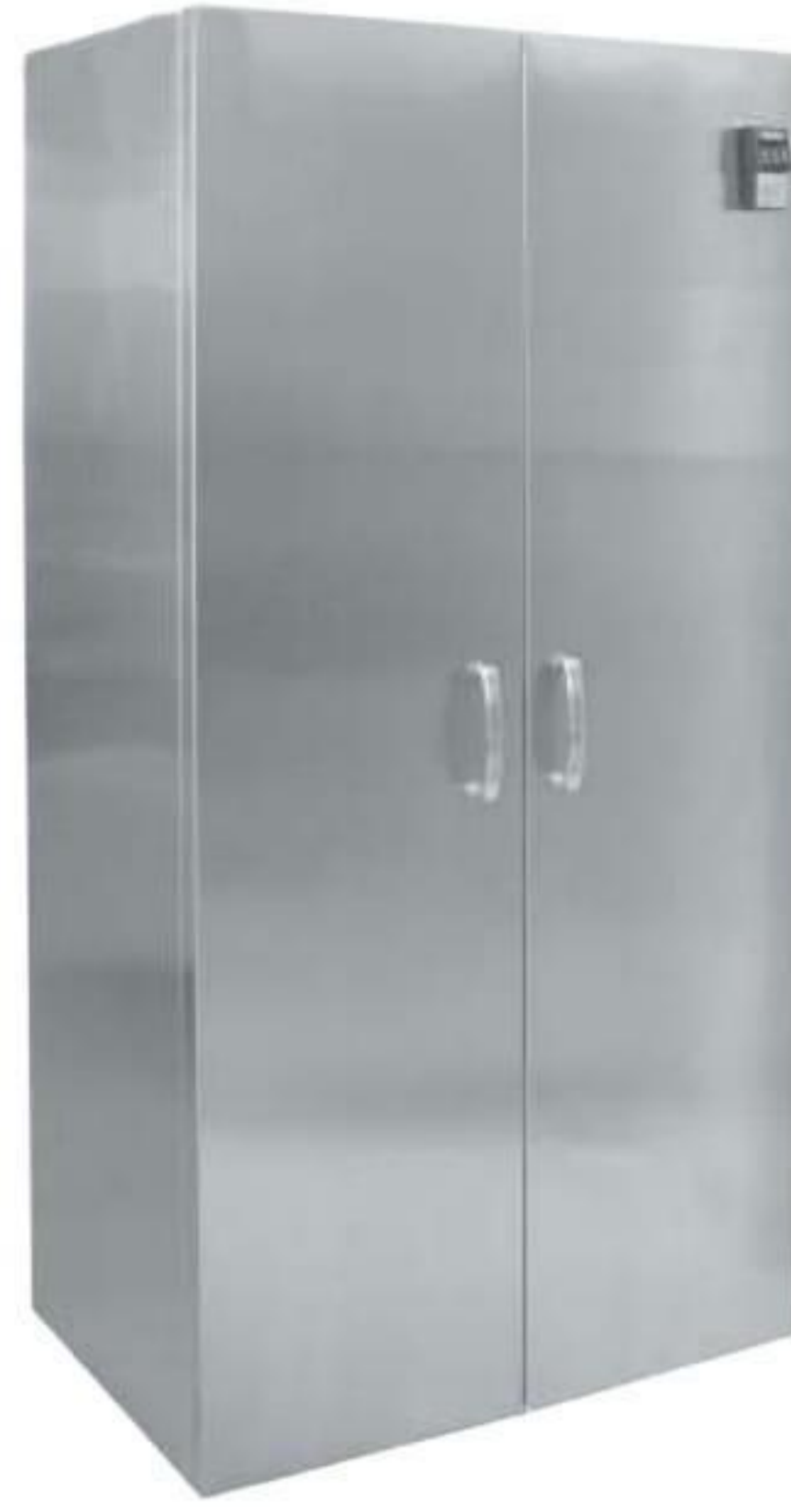
YIBTECH HD 90

UV Cabinet 18/8 304/4N Satin finish, stainless steel. Apron Cabinet with UV light. Dim.: 910x600x1860mm