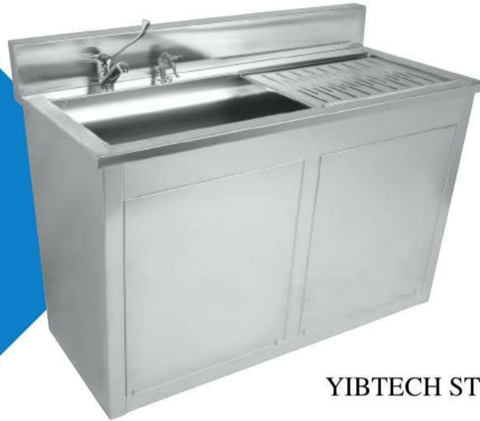
YIBTECH STV 130 AP