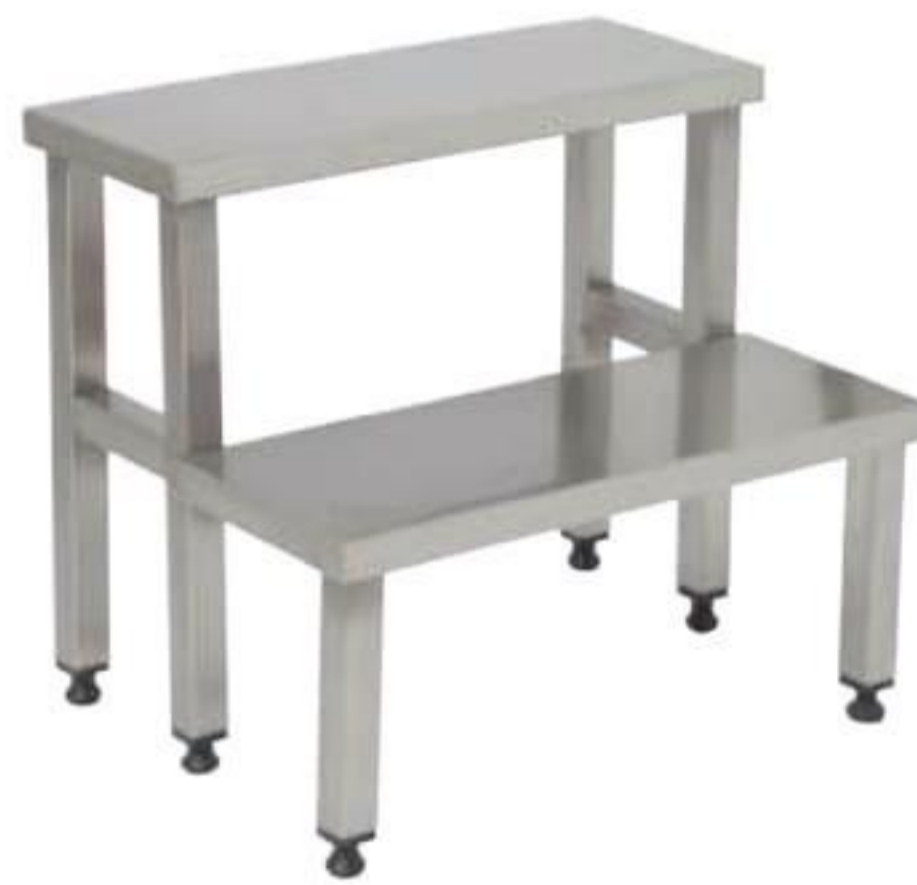
YIBTECH ESB 02

Single Bowl Stand 18/8 304/4N, Satin finish, stainless steel. 4 casters (antibacterial). 28/2 tubing, Ø33cm bowl.