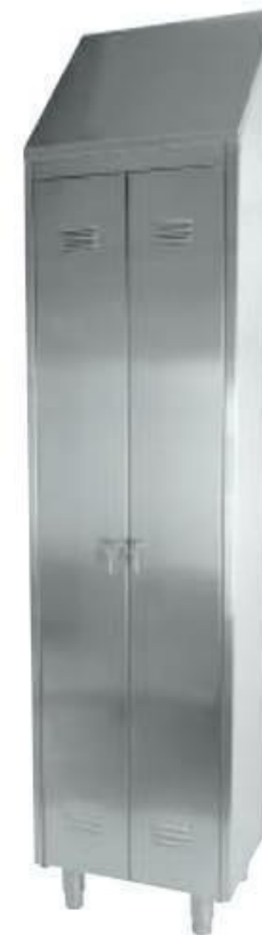
YIBTECH ISD 02

Janitorial Sink 304/4N Satin finish, stainless steel. Single basin with tap, bucket grating.