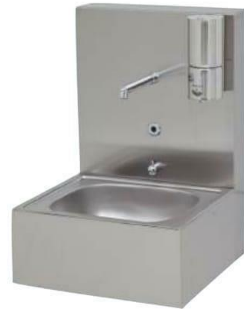
YIBTECH STD 50 F

Hand Washing Sink 18/8 304 4/N Satin finish, stainless steel. Round basin with plain barrier. Surface mounted. Dim.: Ø400x345x830mm