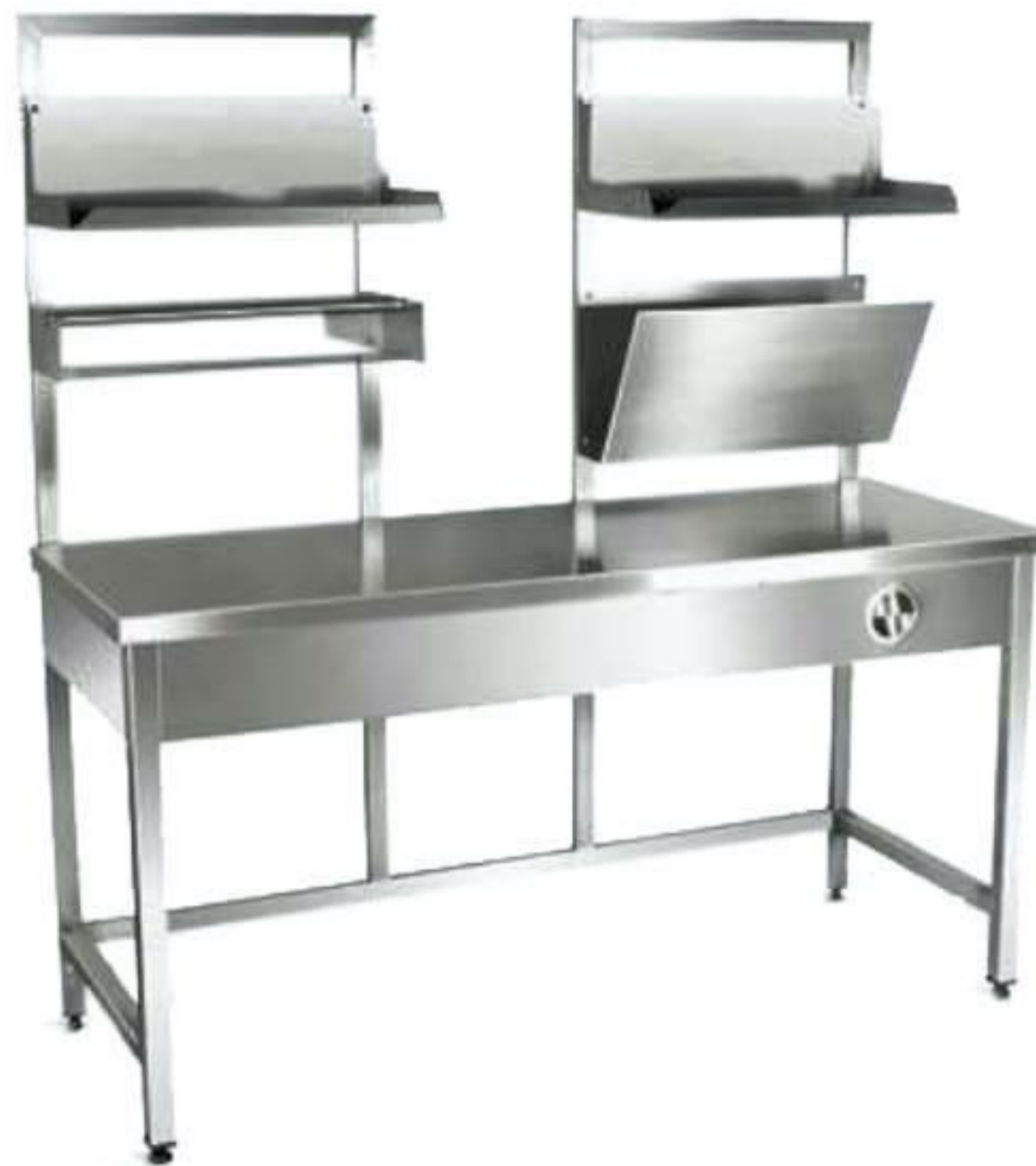
YIBTECH STMP 01

Packaging Table 18/8 304/4N Satin finish stainless steel. Square tubing with tabletop. Dim.: 1800x600x850mm