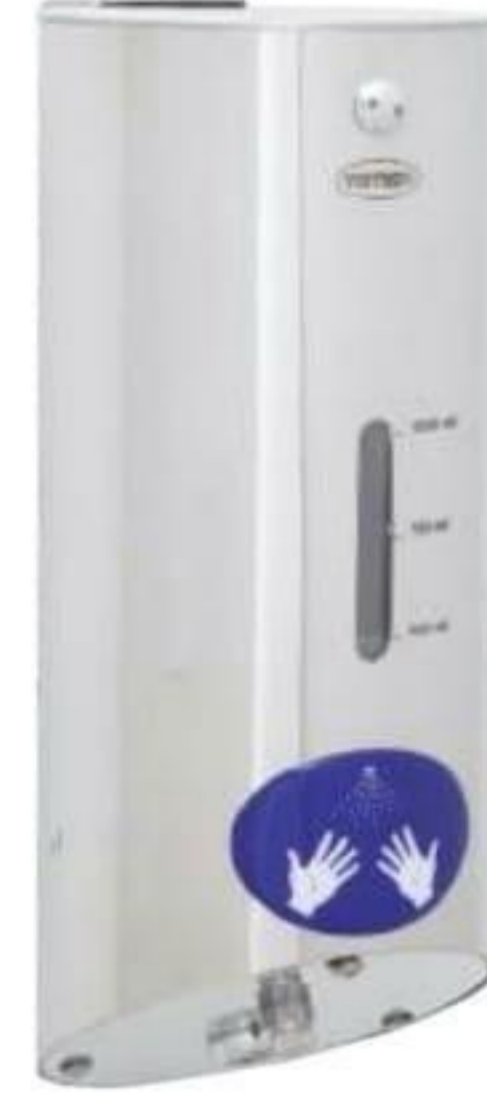
YIBTECH FS 1250

Soap/Disinfectant Dispenser 18/8 304/4N stainless steel. 2.5lt volume. Transformer 220/240V 50Hz