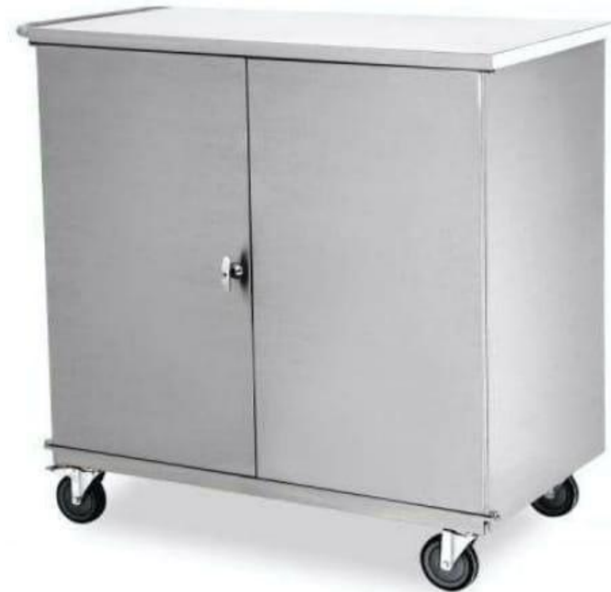
YIBTECH TA 03

Laundry Trolley Cabinet with bag holder. Clean linen can be distributed while collecting dirty laundry. 4 casters. Push bar and lock system.