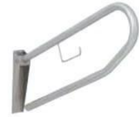
YIBTECH BEH 75

Gab Bar 304/4N Satin finish, stainless steel. Dim.: Ø32x750mm