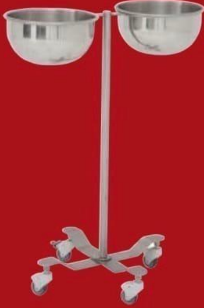
YIBTECH PK 02

Double Bowl Stand 18/8 304/4N, Satin finish, stainless steel. 4 casters (antibacterial). 28/2 tubing, Ø26 cm bowls.