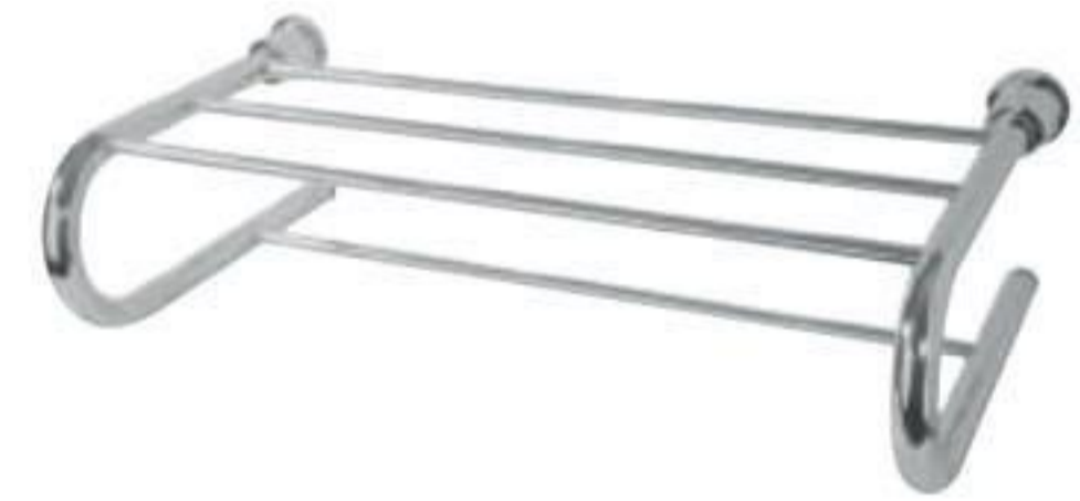
SR L 5029 L