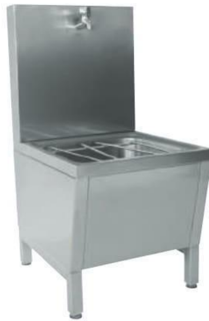
YIBTECH STV 50 PY

Narcotic Cabinet 304/4N Stainless steel. Wall mounted. Double door with shelves. Lock system.