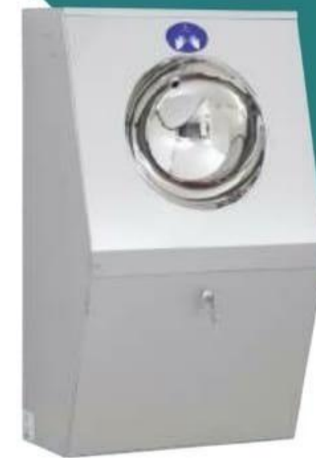
YIBTECH FED 01

Soap/Disinfectant Dispenser 18/8 304/4N stainless steel. 0.8lt or 1lt volume. Transformer 220/240V 50Hz