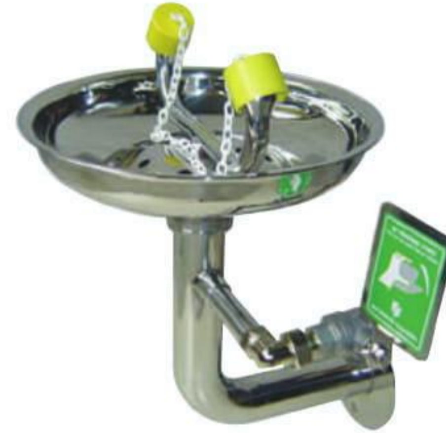
YIBTECH Y 05 D

Emergency Shower & Eye Wash 304/4N Stainless steel. Standing.