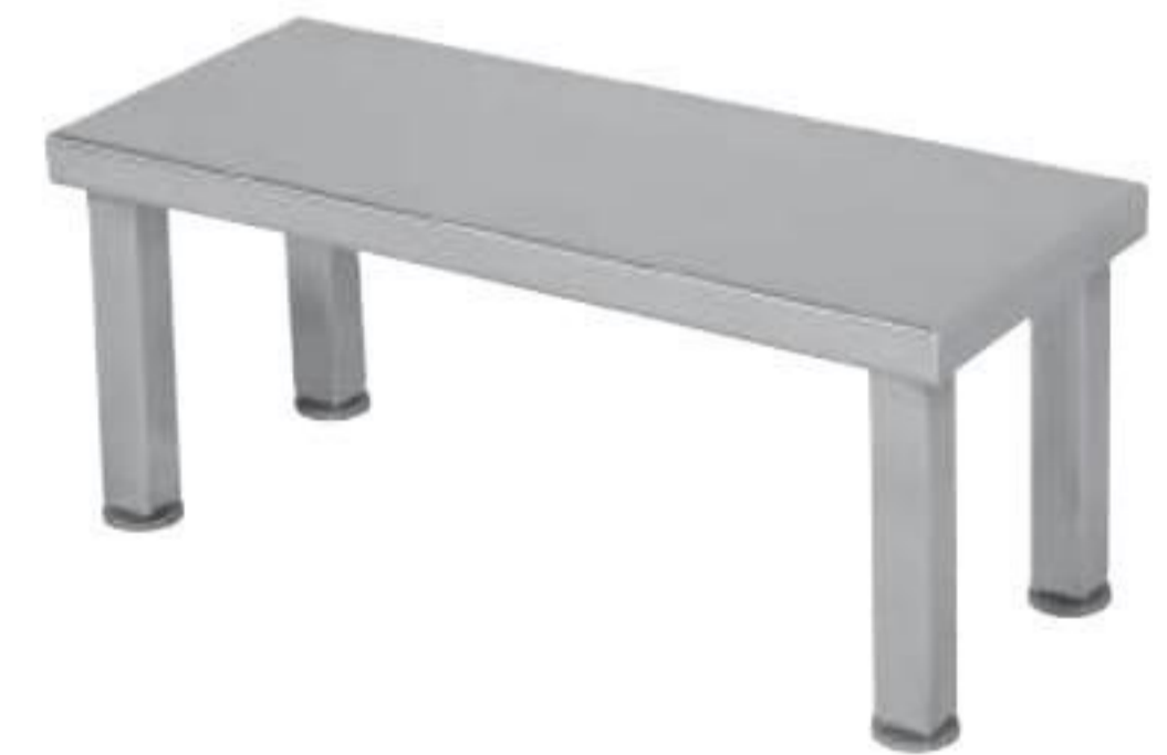
YIBTECH ESB 01

Escabo, Double 18/8 304/4N, Satin finish, stainless steel. 40x40 mm stainless steel profiles. Antislip finish. Dim.: 650x600x220-400 mm