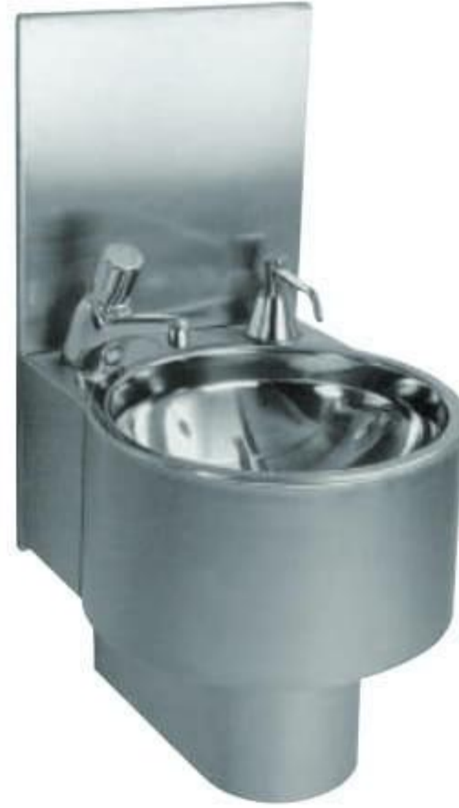
YIBTECH STR D 40

Hand Washing Sink 18/8 304 4/N Satin finish, stainless steel. Round basin with perforated barrier. Surface mounted. Dim.: Ø400x345x830mm