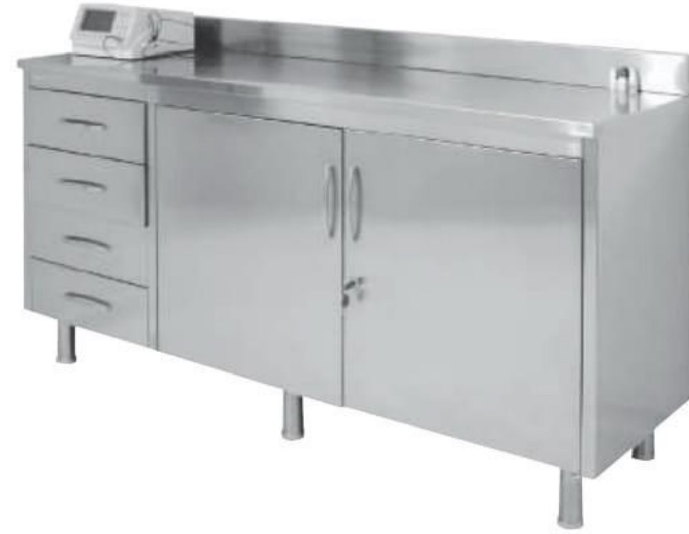
YIBTECH AML 01

Double Bowl Stand 18/8 304/4N, Satin finish, stainless steel. 4 casters (antibacterial). 28/2 tubing, Ø26 cm bowls.