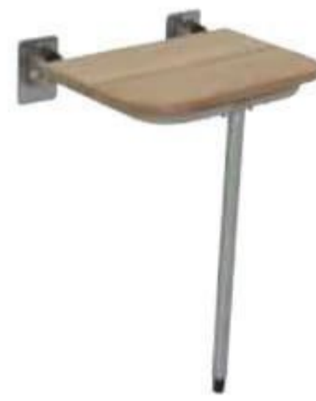
YIBTECH BOT A

Gab Bar 304/4N Satin finish, stainless steel. Teak wood seat and back.