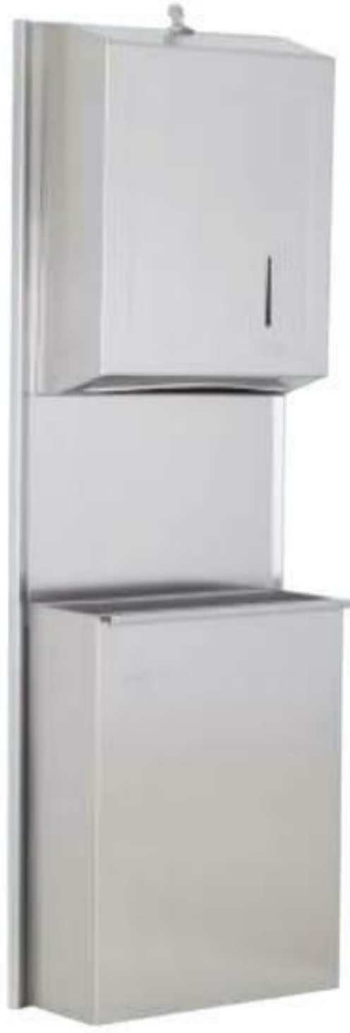
YIBTECH STS 100

Paper Towel Dispenser 18/8 304 4/N Satin finish, stainless steel. Paper towel dispenser with waste receptacle. Surface mounted. Lock system. Dim.: 300x120x1000mm