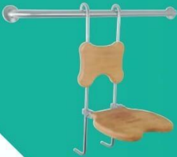
YIBTECH BOT AS

Gab Bar 304/4N Satin finish, stainless steel. w/toilet paper hanger. Dim.: Ø32x750mm