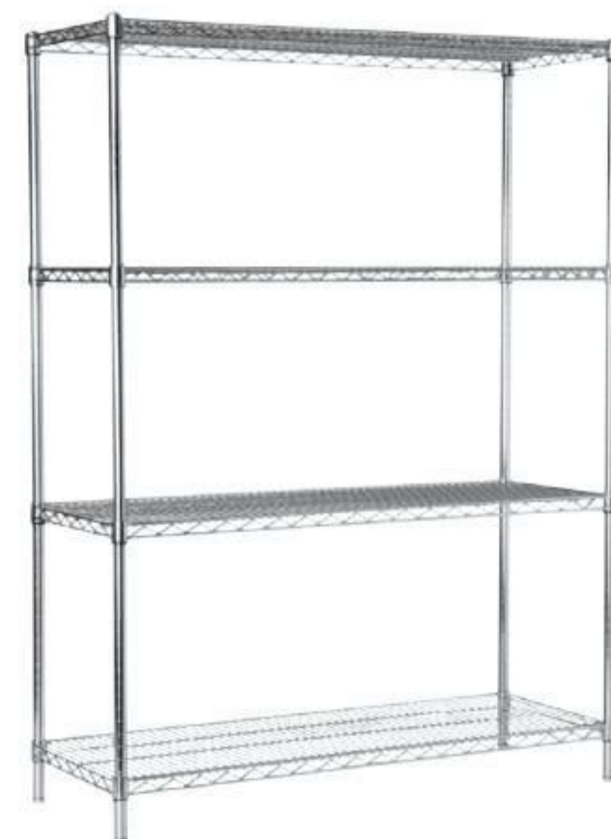
YIBTECH YN 01

Textile Examining Table 18/8 304/4N Satin finish stainless steel. Square tubing structure. Tempered surface glass and fluorescent lighting. 4 casters, 2 with brake. Dim.: 1800x600x850mm