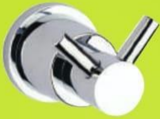
SR L 500

Hair Dryer-1600W 2 air flow settings, 3 air temperature settings. COOL air setting. Shaver socket 110-220V and 220-240V.