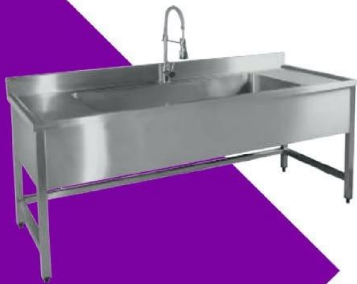
YIBTECH ST EY

All works with 220V 50Hz- Total Power: 350 Watt.