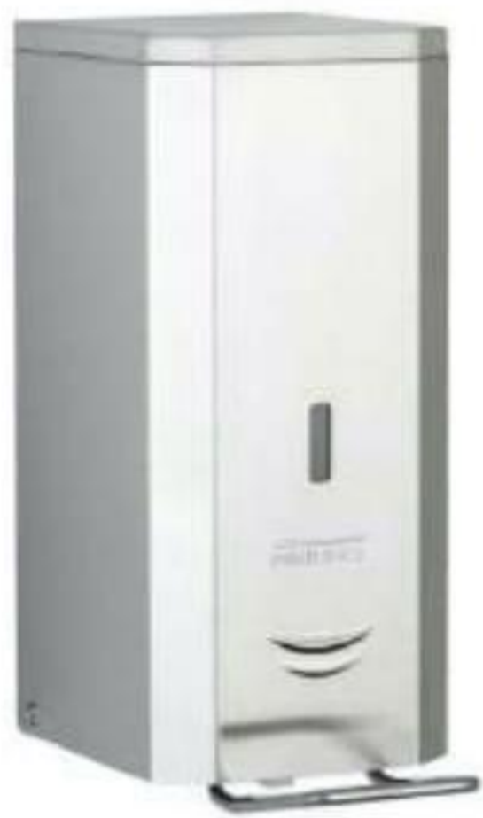
DJP 0034 CS Soap Dispenser DJP 0035 CS Foam Dispenser

Soap/Disinfectant Dispenser 18/8 304/4N stainless steel. 1.25lt volume. Transformer 220/240V 50Hz