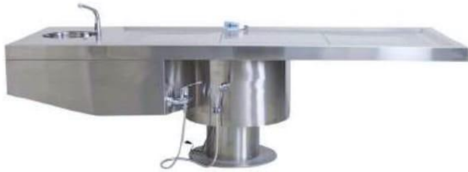
YIBTECH STK OT / 02