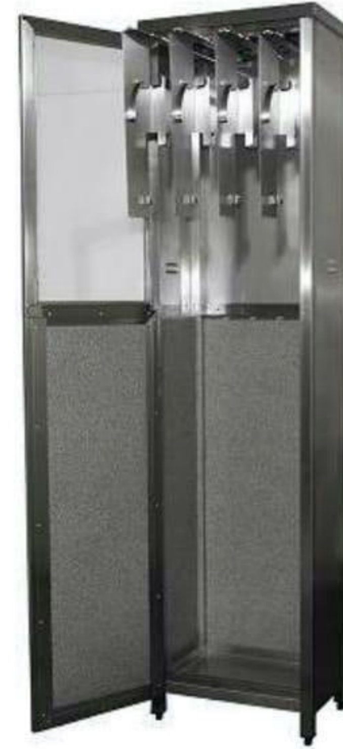
YIBTECH END-04 Stainless Steel Endoscopy Cabinet YIBTECH END-205 Stainless Steel Endoscopy Cabinet

END-04: 18/8 304/4N Stainless steel. Half glass door. Standing on 4 legs. 4 hangers and dripping pan. Lower side is covered with soft material to avoid damage. Dim.: 600x400x230 mm