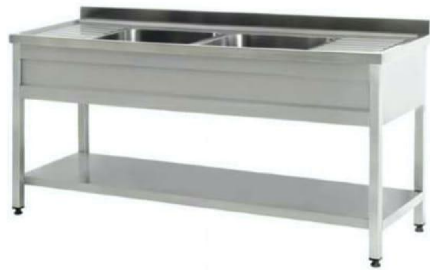
YIBTECH STE 01