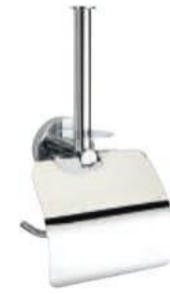
SR L 5007