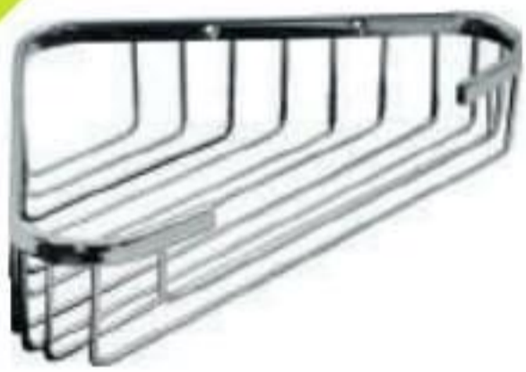
SR L S 024