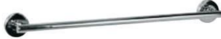
SR L 5020