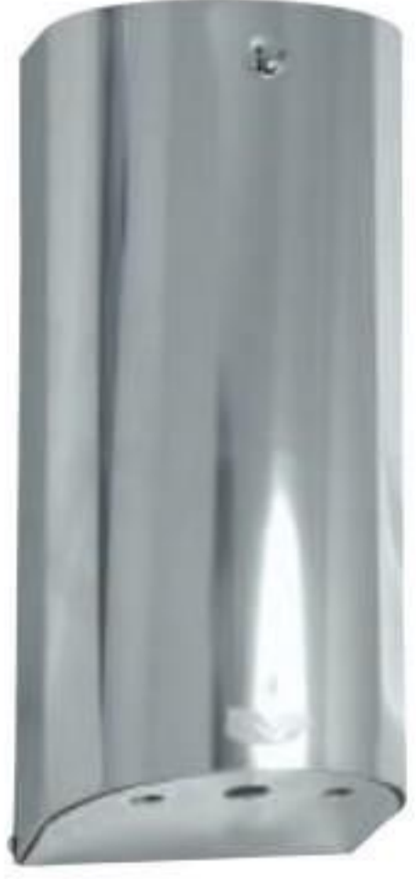
YIBTECH FS 1000 PK

Foam Dispenser 18/8 304/4N stainless steel. Battery operated. 1lt volume.