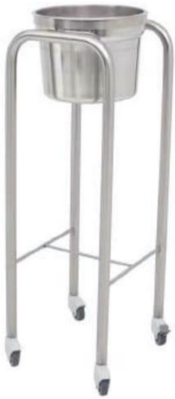
YIBTECH PK 01

Operation Room Work Desk 18/8 304/4N, Satin finish, stainless steel. 4 drawers. Cupboard with two shelves. 6 cm back plate. Lock mechanism. 1mm thick steel. Argon welding. Dim.: 1400x700x900 mm