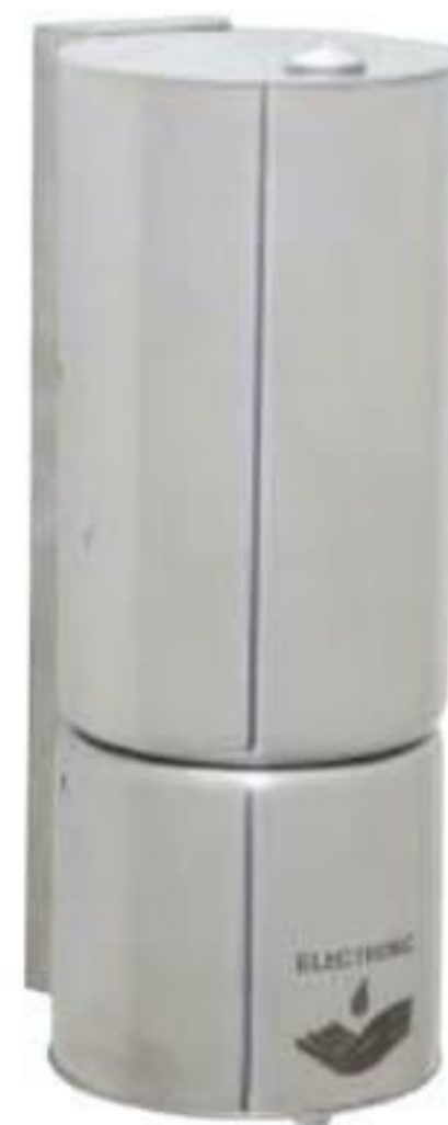
YIBTECH FS 800-1000

18/8 304/4N stainless steel. 1.5lt volume. Manual operation.