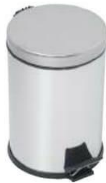
YIBTECH A 331 E

Pedal Bin 304/4N Stainless steel. 5 LT capacity