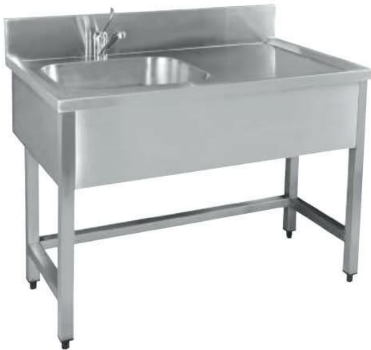
YIBTECH STE 01