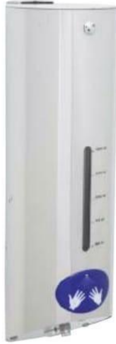
YIBTECH FS 2500

Foam Dispenser 18/8 304/4N stainless steel. Battery operated. 1lt volume.