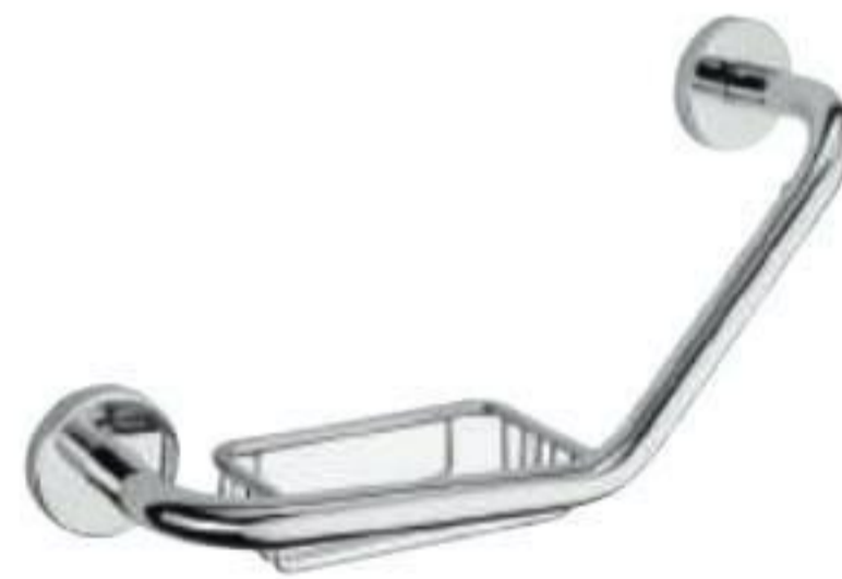
SR L 5024